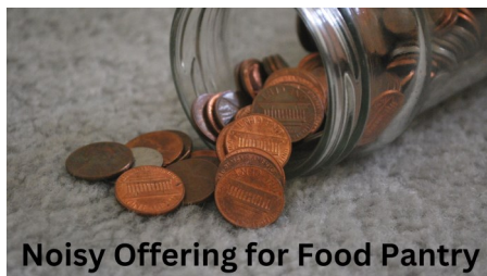
Noisy Offering for Food Pantry